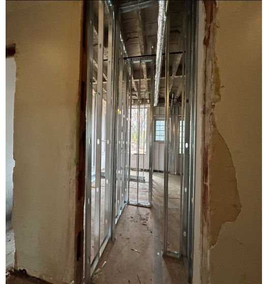
Continue metal stud framing in the 1958 Wing