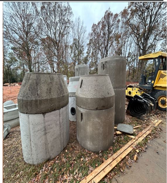
Stormwater distribution material has arrived on-site