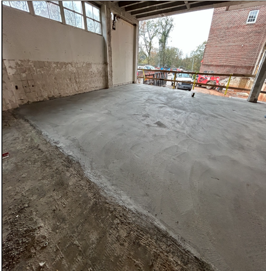
completed topping slab pour back at the 1958 wing