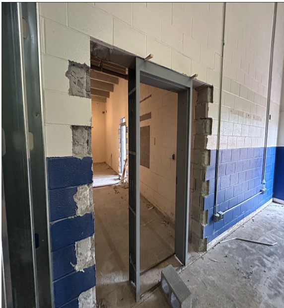
Begin masonry toothing and installing doors at the gym area